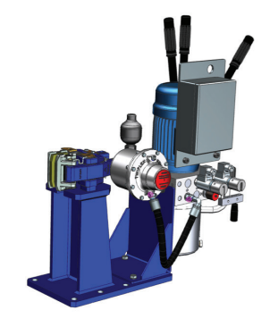
Standard MXSH Disc Brake Caliper Package

Maximum Braking Force: 14.3 kN (3,215 lbf)