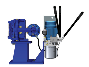
Standard GMRSH Disc Brake Caliper Package

Maximum Braking Force: 14.3 kN (3,215 lbf)